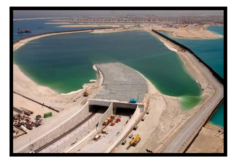
Figure 5: Tunnel during construction

Vehicular Tunnels: The vehicular tunnel was designed by Halcrow International Company and constructed by JV Taisai and Al Naboodah; construction began in March 2005. It was 1400 meters in