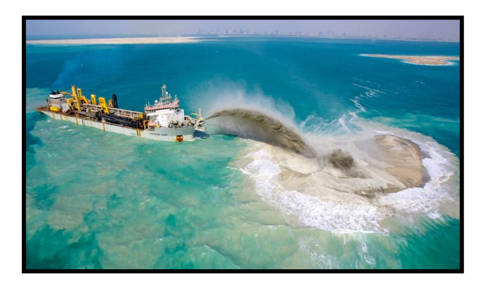
Figure 4: The process of rainbowing sand to create Palm Jumeriah's fronds

It was critical that both the sand and breakwater crews worked together to assure that they were in sync. If the breakwater progressed too quickly, it would cut off the land reclamation team's access to their site. If land was being built too quickly, there was a risk that storms would erode land. In October 2003, two months following the breakwater completion, the land portion of the project was completed. A total of 70 million cubic meters of sand was used in the construction of the fronds. The truck section was about 5 km long and 457 meters wide while each of the 16 palms were about 5km long. The