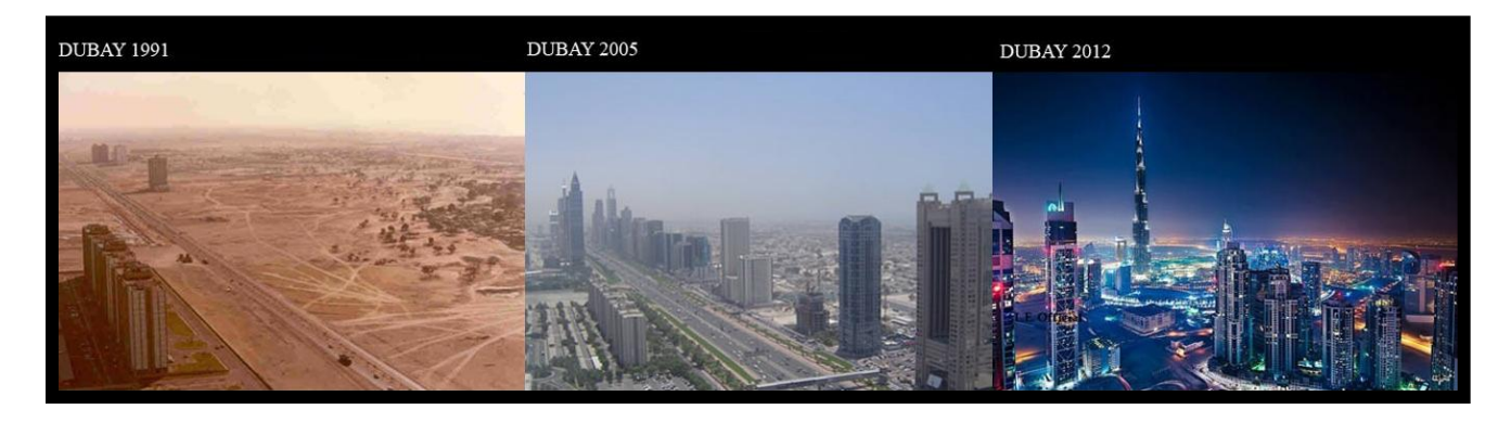
Figure 2: Dubai skyline in 1991, 2005 and 2012

situated in the Persian Gulf to support its trading and pearl exporting industries. Since oil and natural gas was discovered in the area in 1966, Dubai has developed into an infrastructural wonder. In the last 25 years, the change in Dubai's landscape has been dramatic as buildings and roadways have steadily been developing; see Figure 2.