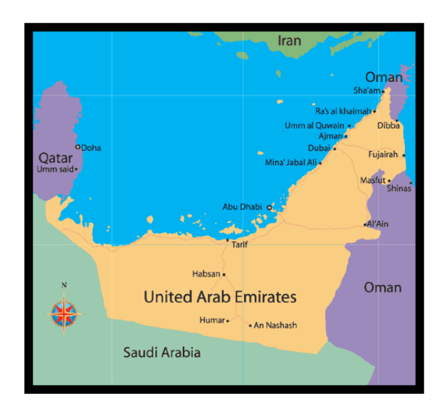
Figure 1: United Arab Emirates

Dubai, the United Arab Emirates most populated city, is an economic hub of the Middle East and is quickly becoming a top tourist destination, majorly due to its idealistic weather, sandy beaches, and luxurious venues; see Figure 1 for location. Only fifty years ago, Dubai was a small town perfectly