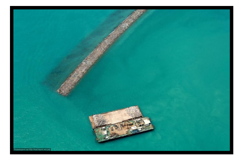
Figure 3: Breakwater Construction PT-2013 Higgins P.3

Design of the breakwater was undertaken by Royal Haskoning while the construction was completed