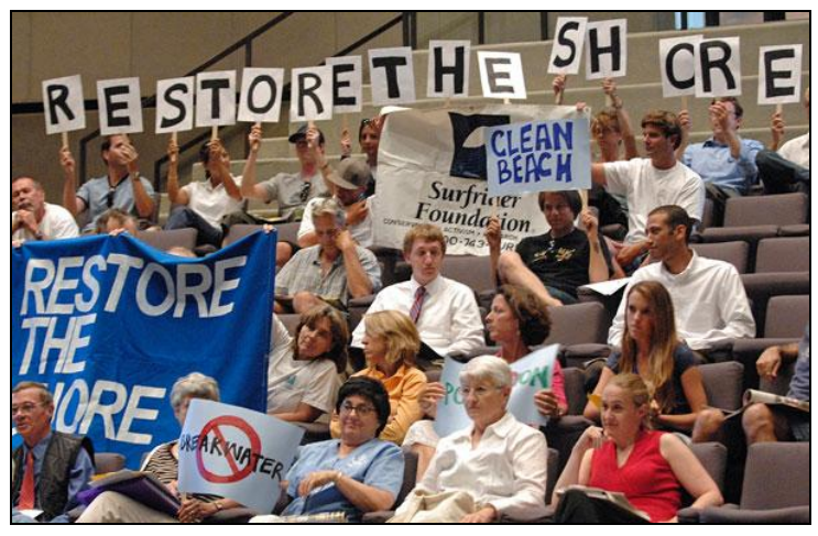
Figure 3.0: Community Support for the Breakwater Removal

The nationally recognized environmental group, The Surfrider Foundation, is leading the grassroots effort to "Sink the Breakwater". The project's goal is to reconfigure the current breakwater which prevents the natural flow of ocean currents in the Long Beach Harbour. They want to remove or reconfigure the Long Beach harbour portion of the breakwater only; the other sections will still remain to protect the harbour against the ocean waves. This foundation has lots of support from the community. Figure 3.0 shows various members of the city during a council meeting. According to this foundation, there are some economic benefits involved with removing this breakwater, which are highlighted in the following sections. [2]