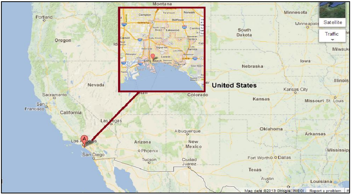
Figure 1: Location of Long Beach, CA

The city started as a seaside resort with small agriculture resources and quickly grew with the discovery of oil on Signal Hill in 1921. Since then, the city has been known for its manufacturing sectors as well as its high technology and aerospace industries.