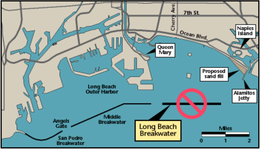
Figure 2: Breakwater Structure Locations

Due to the location of long beach, the Federal Government chose to construct a series of breakwater systems along the coast, starting with San Pedro bay and ending in the Long Beach Breakwater (as seen in Figure 2.0). These breakwater systems were to provide a deep and sheltered harbour for the U.S. Navy's Pacific fleet, as well as to provide protection from submarine attacks. Over the span of 40 years, the breakwater system was constructed in three major sections, with gaps for ships to pass. Together, these breakwaters span 13.4 km along the coast. This port was used by the US Navy since WWI, until they closed their base in 1996. [1] Considering the departure of the US Navy, the residents of Long Beach are lobbying for the removal of the Long Beach section of the breakwater system.