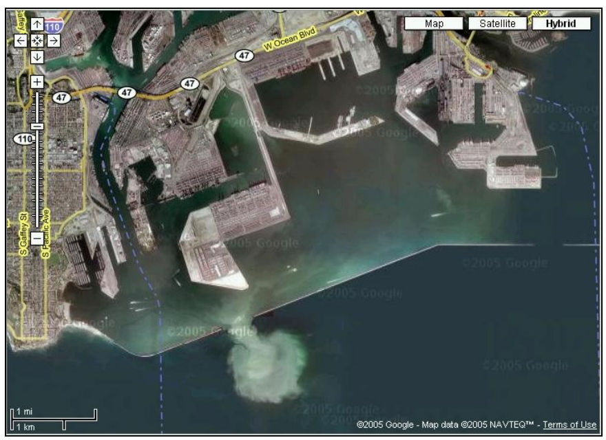
Figure 5.0: Trapped Pollutants in the Long Beach Harbour

By removing or reconfiguring the breakwater structure, it will cause the shoreline to be exposed to wave action that could cause adverse effects. By allowing waves to hit the shore, it could increase erosion along the shoreline and expose residents to the chance of flooding. It could also potentially harm any structures in that area that have been built since the construction of the breakwater, as they are not designed for high wave action.