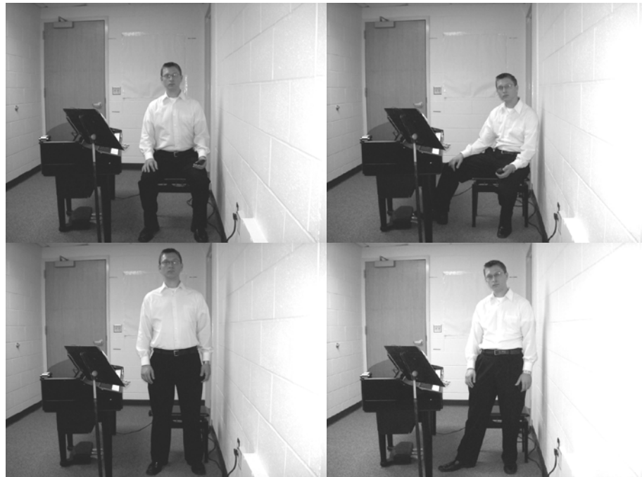
Figure 2. The four instructor postural conditions.

The instructor/researcher then moved back to the piano, 6 ft in front of the participant. He gave the pitches and chord progression again before assuming a (a) seated upright and balanced posture, (b) seated slumped and leaning posture, (c) standing upright and balanced posture, or (d) standing slumped and leaning posture (Figure 2).