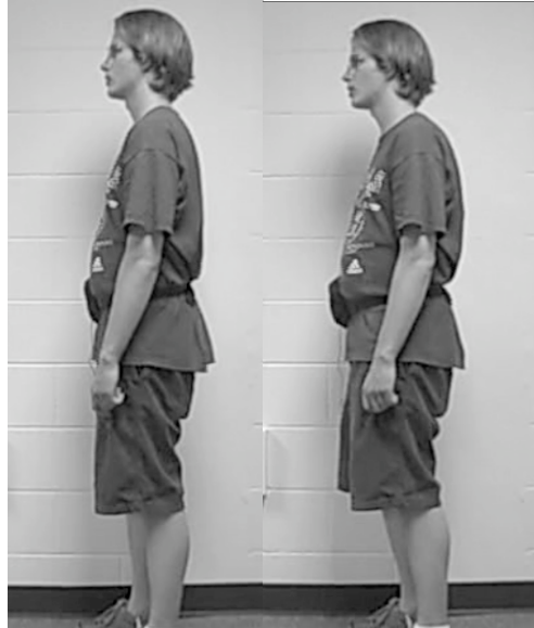
Figure 3. The side view of a participant as viewed by the panel of judges.

The conditions were shown in varied order and the panellists did not know which instructor/researcher postural condition was being employed when assessing the participant images.