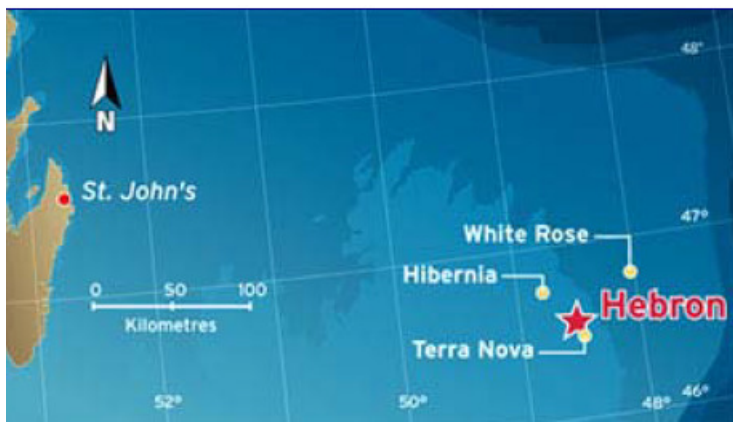
Figure 1 - Location of the Hebron Oil Field [1]

The Hebron oil field was discovered offshore Newfoundland and Labrador (NL) in 1981 in the same area as the Hibernia field. It is located approximately 340km east-southeast of St. John's, NL (figure 1). The oil field is estimated to have 400-700 million barrels of recoverable resources, which will provide substantial benefits to the province.