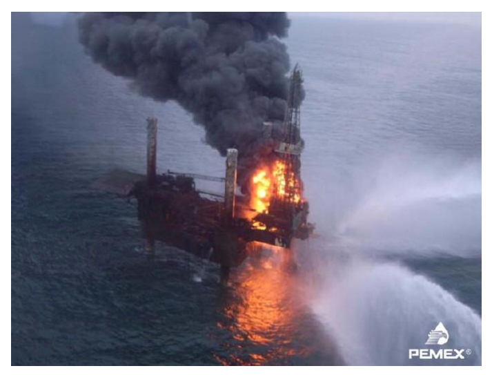
Figure 3: The First Fire on the Kab-101

Around 1420 hours the subsea valves of wells 101 and 121 were closed by PEMEX in order to stop the leakage of oil and gas. Unfortunately the valves were damaged in the collision and some leakage continued after the safety valves were closed. This resulted in an evacuation of the 81 crew members occurred at approximately 1535. On November 13th, a spark from on-going containment work caused a significant fire to ignite on the Usumacinta observed in Figure 3. This fire was put out on November 14th at approximately 2350 hours. A second fire occurred on November 20th causing immense damage to the Usumacinta platform including the collapse of its derrick and severe damage to the cantilever deck and connecting bridge. This damage can be observed in Figure 4.