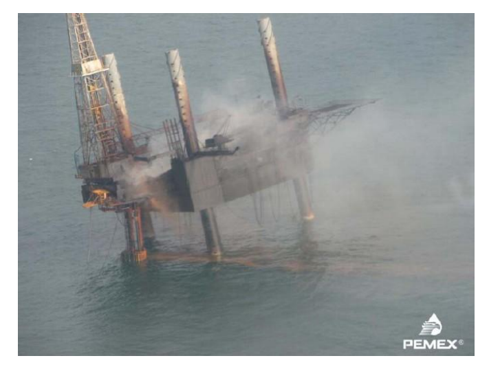
Figure 2: The Usumacinta Leaning Against the Kab-101 Platform

Around 1420 hours the subsea valves of wells 101 and 121 were closed by PEMEX in order to stop the leakage of oil and gas. Unfortunately the valves were damaged in the collision and some leakage continued after the safety valves were closed. This resulted in an evacuation of the 81 crew members occurred at approximately 1535. On November 13th, a spark from on-going containment work caused a significant fire to ignite on the Usumacinta observed in Figure 3. This fire was put out on November 14th at approximately 2350 hours. A second fire occurred on November 20th causing immense damage to the Usumacinta platform including the collapse of its derrick and severe damage to the cantilever deck and connecting bridge. This damage can be observed in Figure 4.