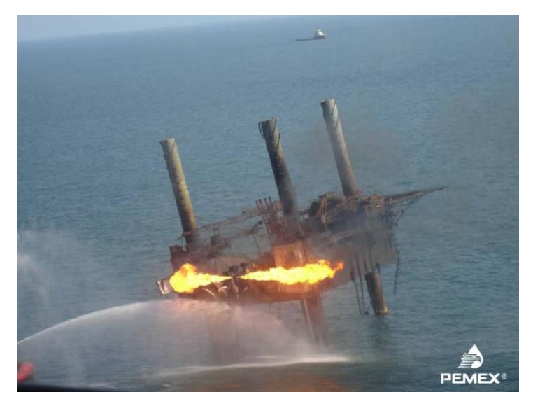
Figure 8: The Control Burning Valve in Use