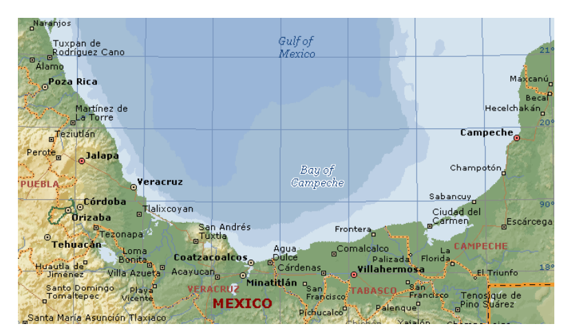
Figure 1: The Bay of Campeche and Surrounding Area

The mat-supported jack-up, Usumacina was based on the previous design of the Bethlehem JU-200-MC. It was delivered in 1982 by Bethlehem Steel in Singapore to Perforadora Central operating out of Mexico. The offshore vesel's main operational role is to move from site to site and perform drilling support for stationary platforms. The crew accommodation of the rig is 81 personnel.[2] In October 2007, the Usumacinta was contracted to drill a well for Petroleos Mexicanos (also known as PEMEX)'s Kab-101 platform in the Bay of Campeche approximately 75 kilometres off the coast of the Tabasco region near the port of Dos Bocas.