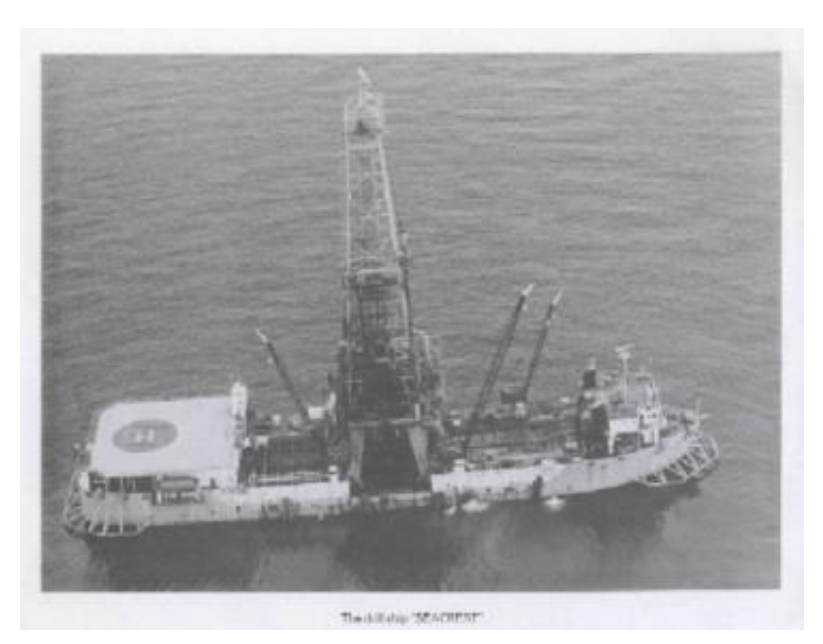
Figure 1: The Seacrest