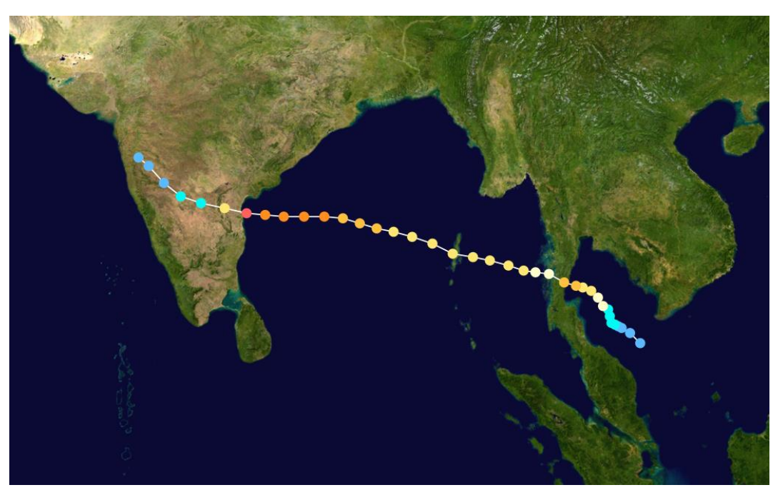
Figure 2: The Path of Typhoon Gay (1989) [4]

Five hours later the storm was officially upgraded to typhoon status, by the Thai Meteorological Department. [2]