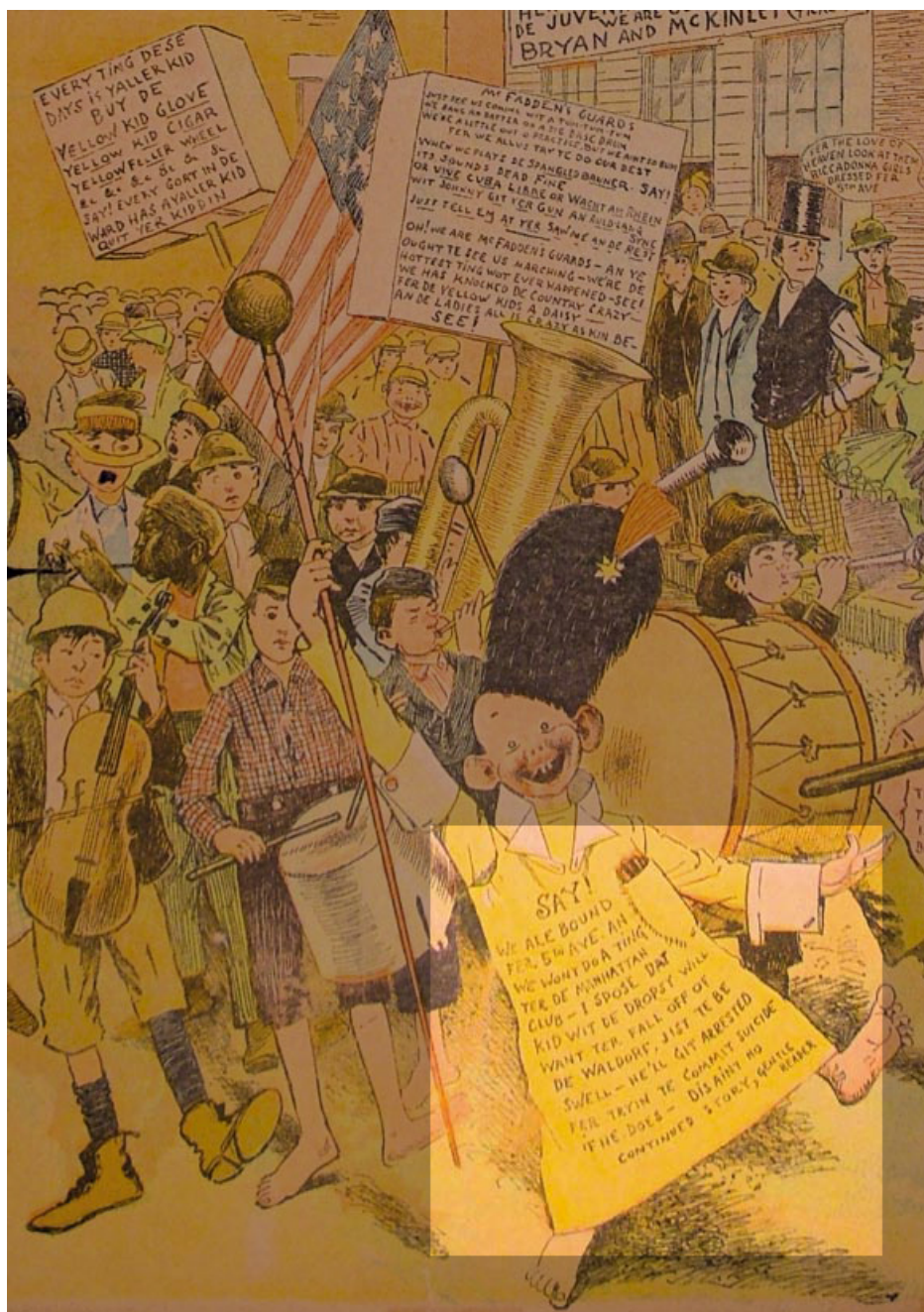
Figure 8. "Say! We Are Bound for 5 th Ave." 25 Oct. 1896. Detail.

sometimes with as many as fifty human figures and a half-dozen (or more) animals of various