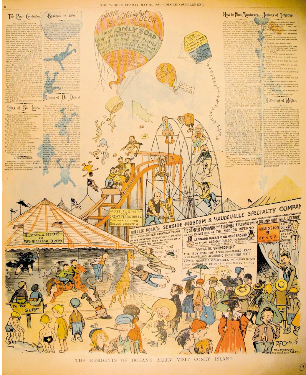
Figure 1. "The Residents of Hogan's Alley Visit Coney Island." 24 May 1896.