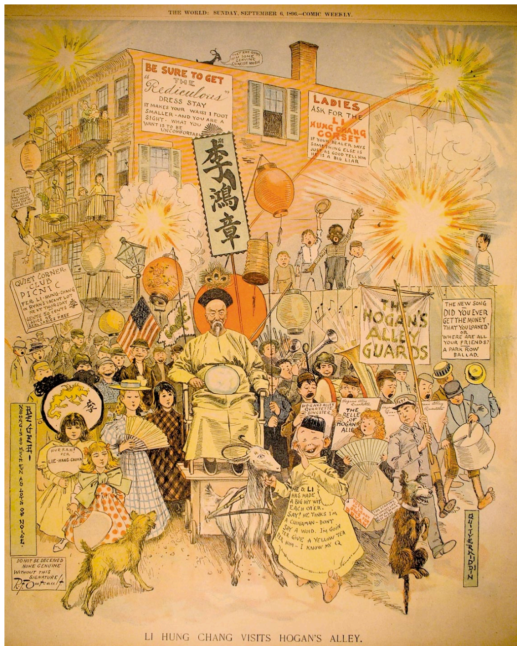
Figure 2. "Li Hung Chang Visits Hogan's Alley." 6 Sept. 1896.

San Francisco Academy of Comic Art Collection,