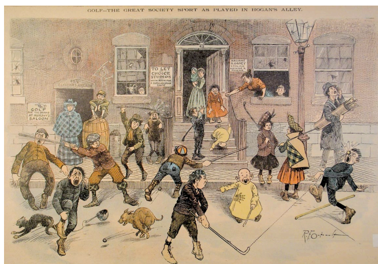
Figure 7. “Golf – The Great Society Sport as Played on Hogan’s Alley.” 5 Jan. 1896.

http://journals.library.mun.ca/ate/v2/Moffett/Figure%206.jpg