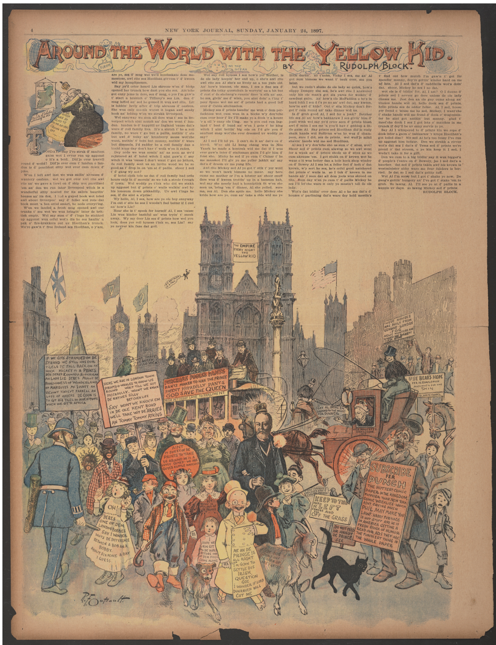
Figure 3. "Me and De Prince." 24 Jan. 1897.

http://journals.library.mun.ca/ate/v2/Moffett/Figure%203.jpg