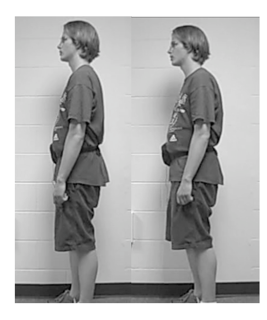
Figure 3. The side view of a participant as viewed by the panel of judges.

The conditions were shown in varied order and the panellists did not know which instructor/researcher postural condition was being employed when assessing the participant images.