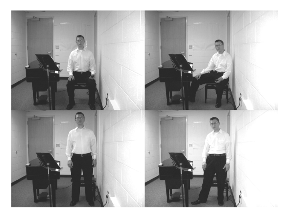
Figure 2. The four instructor postural conditions.

The instructor/researcher then moved back to the piano, 6 ft in front of the participant. He gave the pitches and chord progression again before assuming a (a) seated upright and balanced posture, (b) seated slumped and leaning posture, (c) standing upright and balanced posture, or (d) standing slumped and leaning posture (Figure 2).