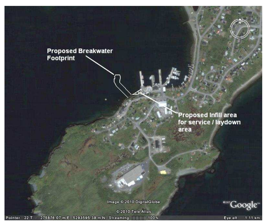
Figure 4: Laydown Area http://www.env.gov.nl.ca/env/env_assessment/projects/Y2010

Construction of this project is subject to DFO SCH operational priorities and funding. Construction is expected to take 5 months to complete. Commencement of the proposed project was tentatively scheduled for spring of 2012 but due to funding has been postponed until funding becomes available.