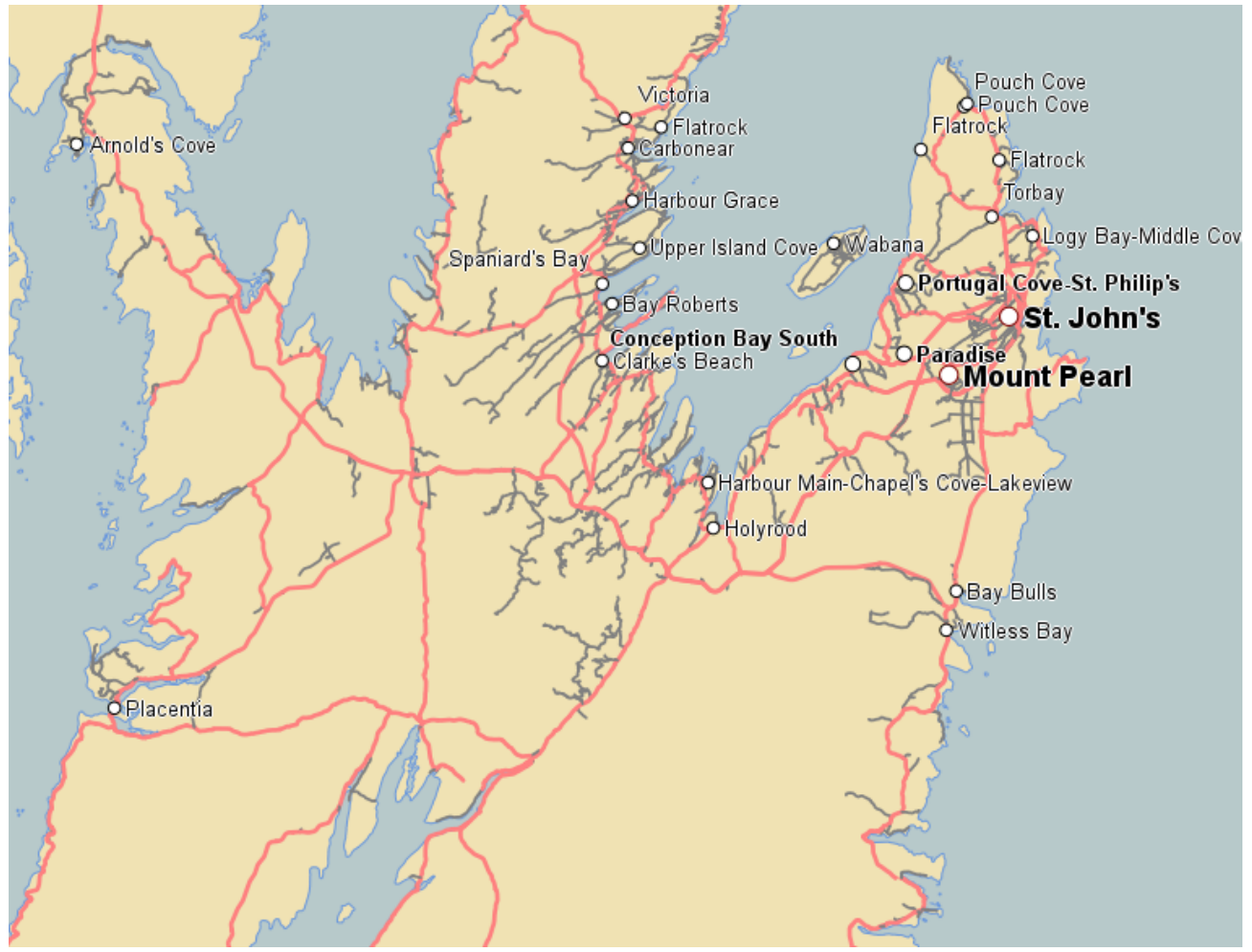
Figure 1: Map of Avalon Peninsula

It had its beginning in the early 1800's as a fishing community. Arnold's Cove had its beginnings in the early 1800's as a fishing community. The railway and the resettlement of smaller outport's aided in the growth of this community to where it stands today. It remains as a fishing community however with less reliance on the fishery since the moratorium on the cod fishery in 1992. The harbour remains ice-free year round enabling year round operations out of the port.