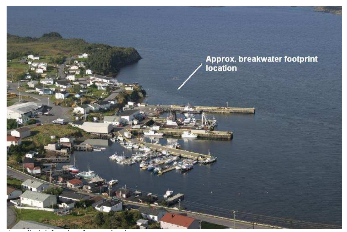
Figure 3: Breakwater Location http://www.env.gov.nl.ca/env/env_assessment/projects/Y2010

The proposed undertaking represents an enhancement of the existing Department of Fisheries and Oceans Small Craft Harbours (DFO SCH) facilities in Arnold's Cove, Newfoundland and Labrador. It involves the construction of a rubble mound breakwater, which will provide shelter to the existing wharf infrastructure from harsh wave action and undertow conditions. The rubble mound breakwater will provide shelter to the wharf during storm conditions and provide safer operating conditions for the facility users. As this harbour is critical to the fishing industry for the area, this proposed project complies with DFO SCH's mandate to keep such harbours open and in good repair. As the infrastructure to be protected is already in a fixed position, there is really only one feasible location for the proposed breakwater.