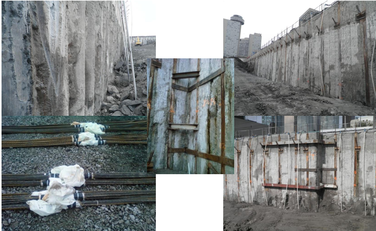
Figure 4: Pier 27 From Top Left To Bottom Right, Centre: Unshaved Caisson Wall; Shaved Caisson Wall And Stressed Upper Tiebacks; Grout Bags; Two Levels Of External Walers; And Two Levels Of Corner Braces