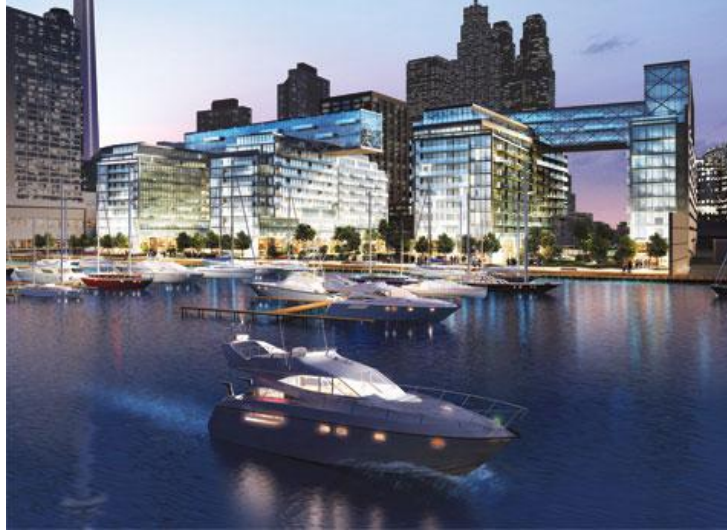
Figure 1: Architectural Rendering of Pier 27

Historical maps dating back to 1867 indicates that the original Lake Ontario shoreline was located approximately along Front Street. In 1911, backfilling had begun along the shoreline with landfill in order to create new piers and industrial development. By 1913, a new street along Lake Ontario was created called Lake Street (now known as Lakeshore Boulevard). By 1964, the shoreline had moved almost a kilometre (km) from Front Street to just past the street that is now known as the Queens Quay.