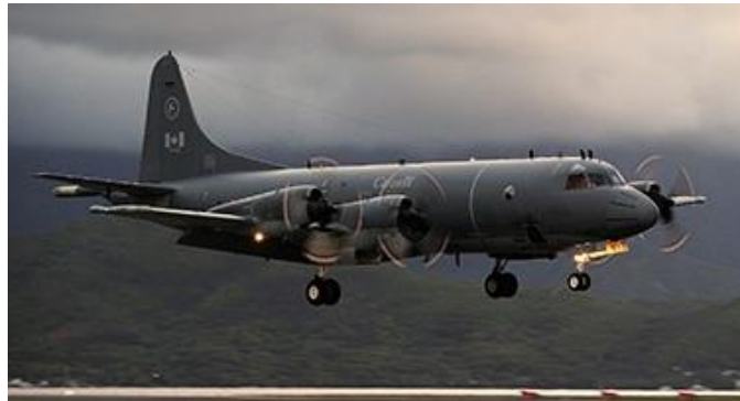
Figure 4-1: Canadian Forces Aurora SAR Aircraft

Once the seas had subsided, all 26 personnel were safely rescued from the lifesaving capsule by the Smit London , with aid from a Canadian Forces Long Range Search and Rescue Aircraft, known as an Aurora , shown in Figure 4-1. While the lifesaving capsule had no exterior light, the Aurora eliminated the area, allowing the Smit London to remain in close courters prior to and during the rescue. Transfers from the life capsule to the tug lasted roughly an hour. There were no injuries to the crew aside from minor seasickness.