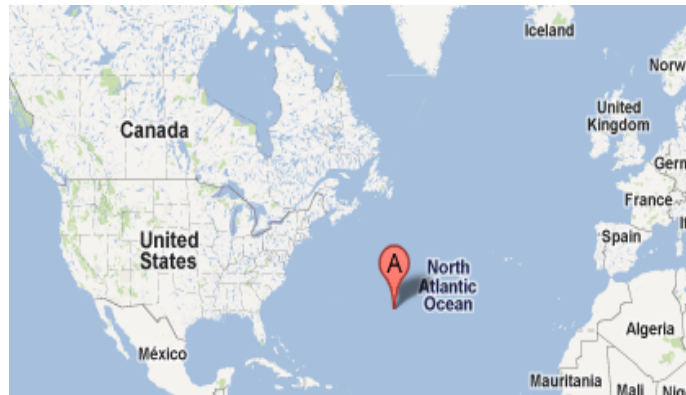
Figure 2-1: Location of Rowan Gorilla I Disaster

After days of abuse, the tow line from the tug broke while the 26 risers on the rig struggled to control the flooding. By December 15 th , the captain of the Smit London noticed the MODU was severely trimmed by the stern and warned the rig superintendent of the imminent danger of sinking. As a series of waves approximately 15 – 18 meters high pounded the rig, the remaining cargo was extricated and the stern hung below the seas. The crew was ordered to abandon the rig and only hours later, the Rowan Gorilla I was observed capsizing on its aft legs. The position was noted to be approximately 30° 56'N, 52° 47'W, in roughly 4900 meters of water. Figure 2-1 shows the relative location of the casualty.