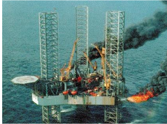
Figure 1-1: Rowan Gorilla I Profile [1]

The Rowan Gorilla I was roughly 90 meters long, 89 meters wide, and 9 meters deep with a triangular hull design. The rig was equipped with three independent 154 meter legs of truss construction, as can be seen in below. The unit was owned and operated by Rowan Companies Inc. with homeport in Houston, Texas.