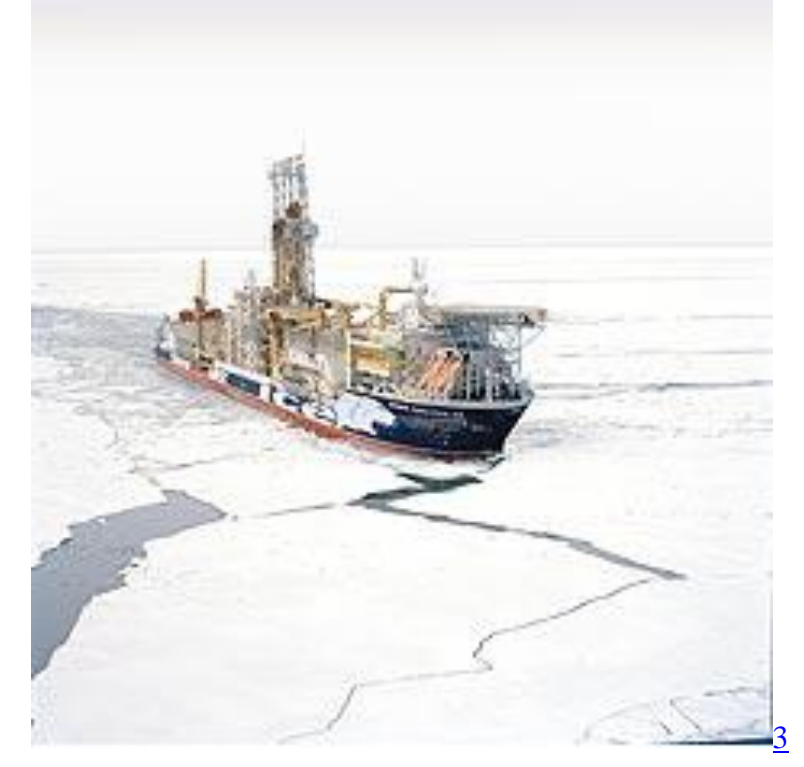
Figure 2 Stena Drilling Drillmax Ice

Adapting DP drillships to operate in the arctic will involve some changes to the vessel design, which will involve a strengthening of the hull in order to survive ice forces, as well a possible redesign of the vessel bow to a shape more suited to the breaking and deviation of ice flows. Drillship hulls may require some redesign in order to reduce propeller interactions with submerged flows and possible intrusions into the moonpool. The powering requirements for a vessel operating in such rugged environments will increase dramatically to offset both the increase caused by ice forces and the required redundancy in case of either engine or thruster failure.